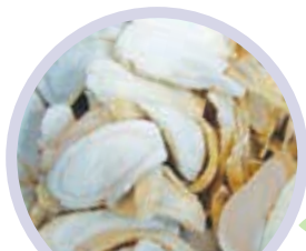
dried ginseng slices

Our smoked salmon rillettes are made from the finest natural Tasmanian ingredients. This product combines the great taste of 41° South hot-smoked baby SALMON® (50%) and a blend of butter, yogurt, spices and Tasmanian Mountain Pepper.